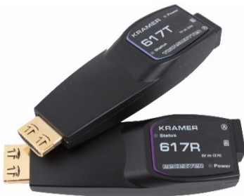
Figure 1: 617T Transmitter and 617R Receiver

Congratulations on purchasing your Kramer 617T and 617R Plug and Play active 4K HDR HDMI Tx/Rx over Extended-Reach Multi-Mode (MM) Fiber Optic cable. 617T and 617R extend signals of up to 4096x2160 @60Hz (4:4:4), over a distance of up to 100m (328ft) without signal scaling or data compression, providing a maximum data rate of 18Gbps. 617T and 617R are easily and securely connected via a 2LC fiber connector and can be powered from the USB connector. Alternatively, 617T only can be powered from the HDMI interface (pin #18).