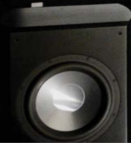
(Shown here on Lunette Series)

The AcousticPro1080P3 is an acoustically transparent front projection material. The angular weave eliminates the moire effect while presenting warm neutral colors for today's high definition 1080P (1920x1080) projectors. The AcousticPro1080P3 allows speaker placement behind while allowing an exceptional acoustically transparent performance.